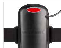
red rear light