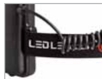
Flexible spiral cable